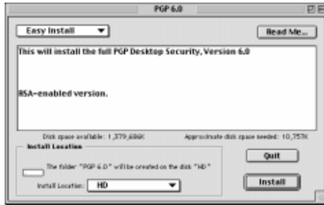
Figure 2-2. PGP for Macintosh Installation screen

The installation screen appears, as shown in Figure 2-2 .