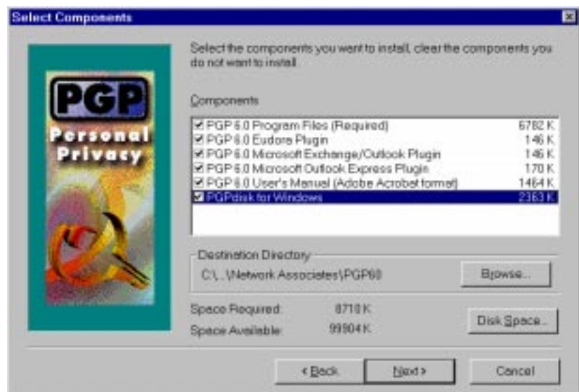
Figure 2-1. PGP for Windows Select Components dialog box

The Select Components dialog box appears, as shown in Figure 2-1 .